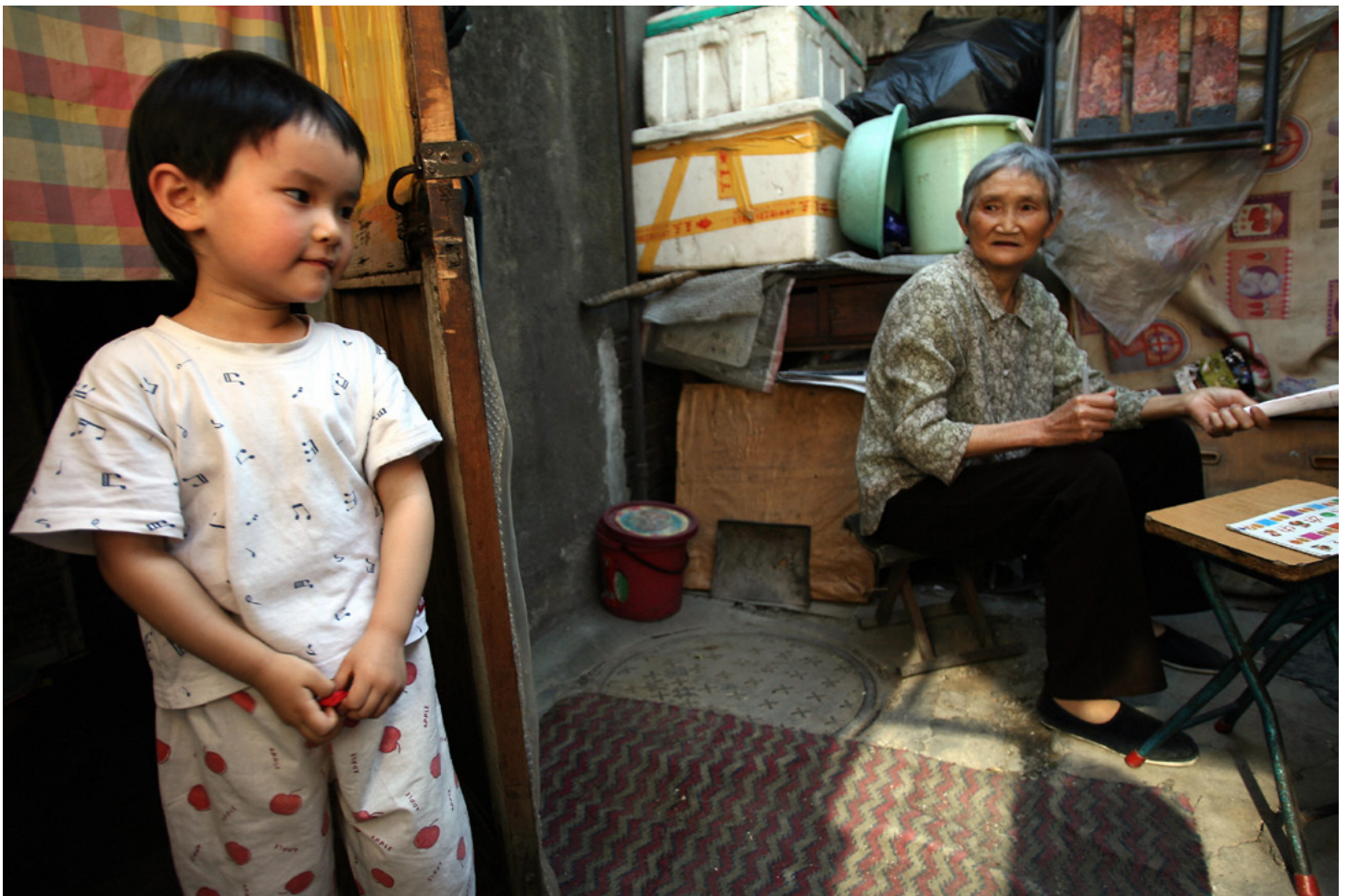
A Chinese elder looks at her granddaughter.