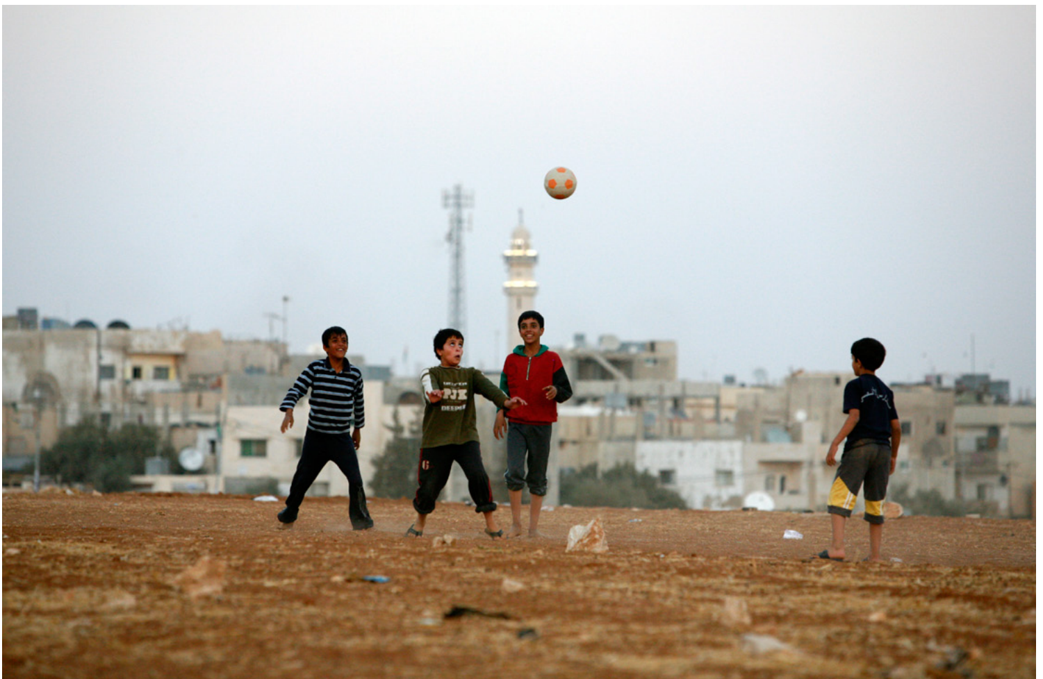
Children play football in Madaba, Jordan.

Three professors at the School of Social Work are working to develop community-based alternatives to institutional placement for children in the child welfare and juvenile justice systems in Jordan.